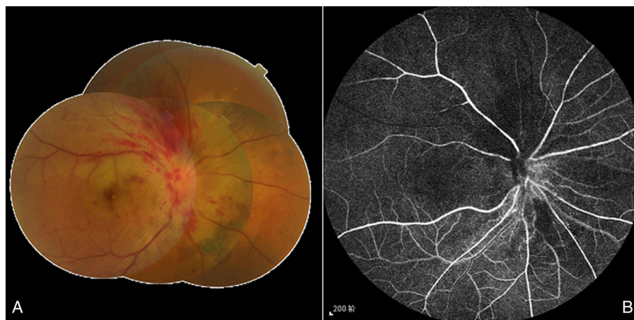
Figure 1 Color fundus photo taken at presentation. (A). Clearly demarcated pale retina in the distribution of the superior temporal artery, swollen optic disc, tortuous and dilated veins. Owing to late presentation and traditional Chinese medicine given initially, the typical blot/dot hemorrhages are almost resolved and flame-shaped effusion of blood can be observed. FA image of the arterial phase 16 seconds after fluorescein dye injection (B). Delayed filling of the superotemporal artery and hypofluorescence in the surrounding artery area can be seen.