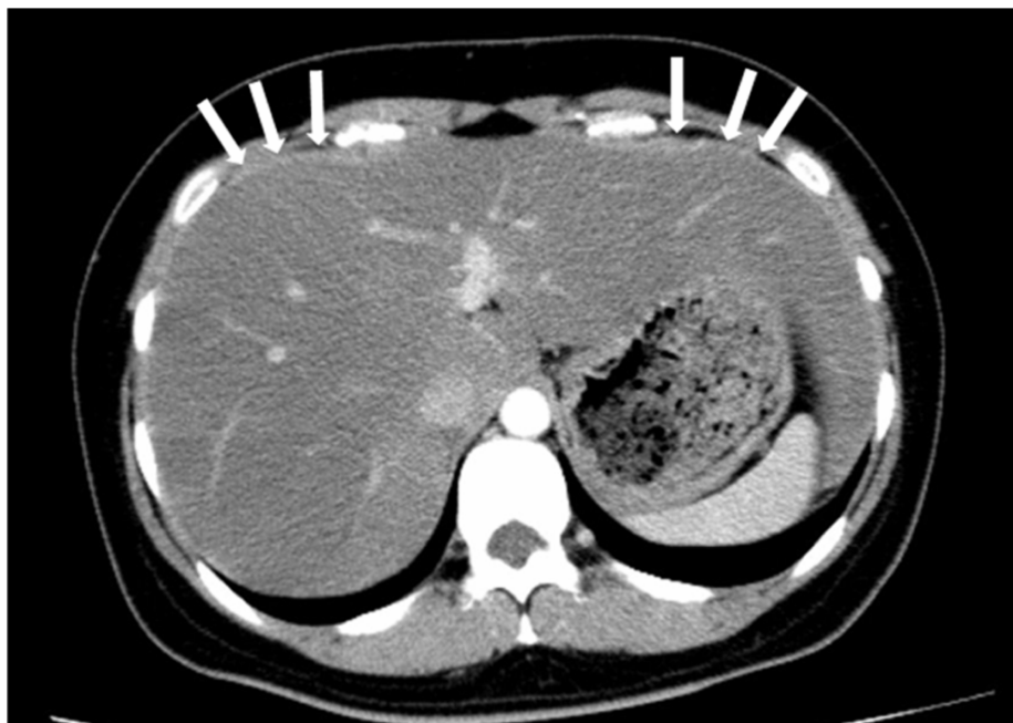
Figure 2. Computed tomography (CT) scan image on initial presentation.

Abbreviations: AZM, azithromycin; LVFX, levofloxacin; CTRX, ceftriaxone; CDTR-PI, cefditoren pivoxil; RUQ, right upper quadrant; RLQ, right lower quadrant; WBC, white blood cell count in the peripheral blood; CRP, C-reactive protein.