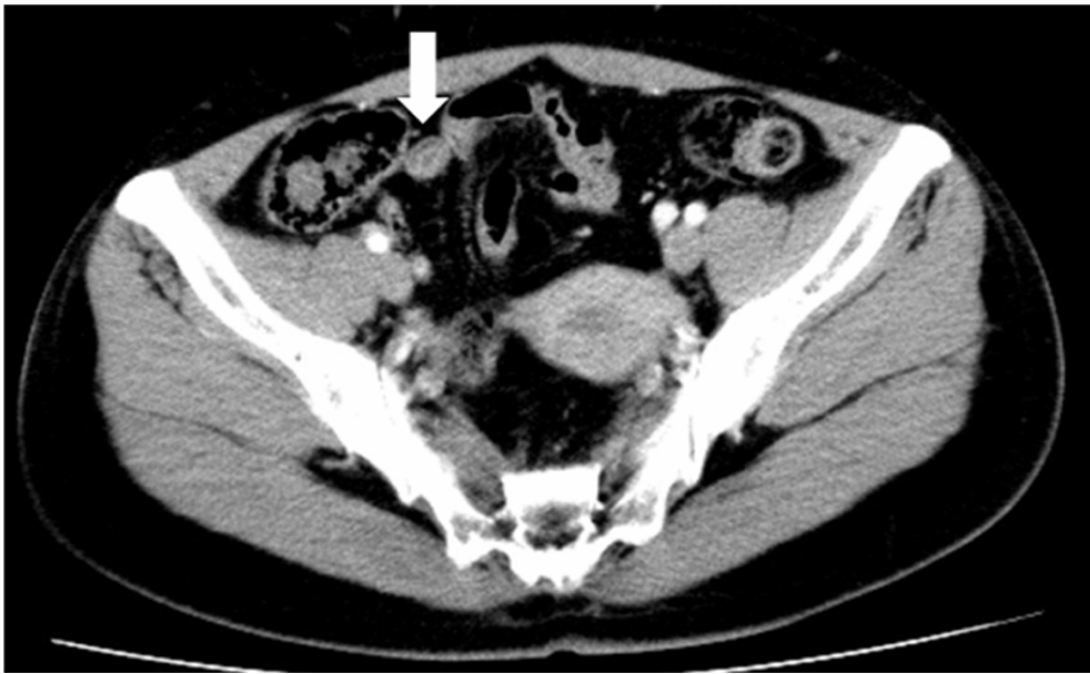
Figure 3. CT scan image after 7 days of levofloxacin treatment. Note: A CT image showing an enlarged appendix with wall thickening (white arrow).

(1.0 g/day), followed by oral administration of cefditoren pivoxil (300 mg/day) (Fig. 1). After an additional 7 days of treatment with these antibiotics (total 14 days), her symptoms, such as a low grade fever and right lower abdominal pain, had completely disappeared. Afterwards, no recurrence of the symptoms or signs was noted, indicating complete remission of the disease.