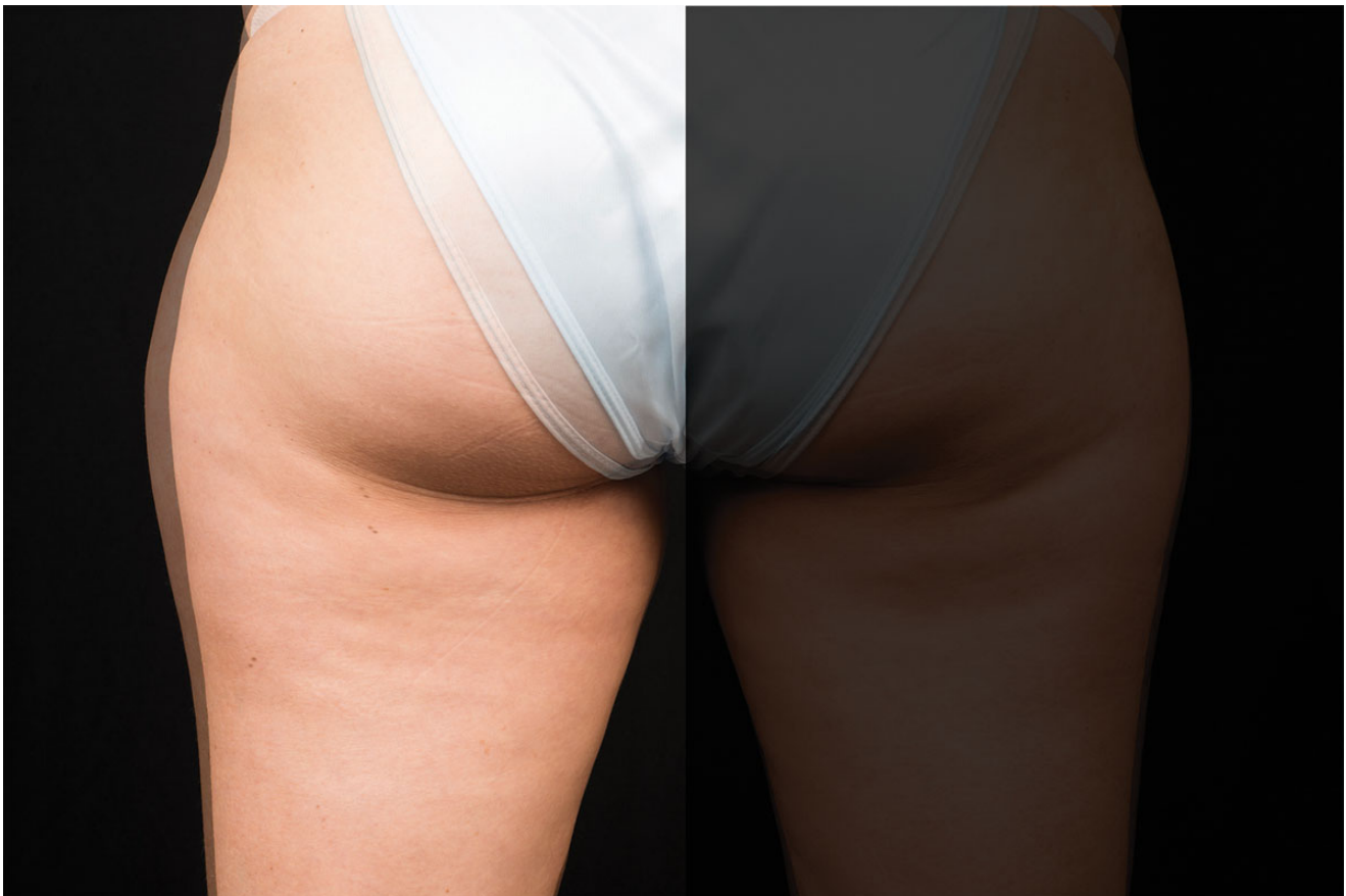
Figure 4. This 41-year-old woman underwent unilateral cryolipolysis of her left thigh to reduce subcutaneous fat. The photographic overlay of baseline and 8-week images shows visible reduction in lateral thigh curvature. The patient gained 5.0 lbs since baseline. (Procedure performed by Dr Grant Stevens, Marina Plastic Surgery.)

Cryolipolysis vacuum applicators have been utilized in numerous clinical studies. The controlled, noninvasive cooling of subcutaneous fat associated with these devices has been shown to be safe in studies of peripheral nerve function, serum lipid levels, and liver function tests. 20,21