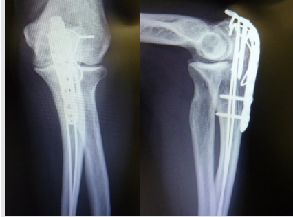
Figure 4: Plain X-ray images 12 months after operation. Plain X-ray examination 12 months after operation showed favorable bone union (A: frontal image, B: lateral image)

complications (such as wire loosening, skin disorder, infection, and non-union) describing that TBW is not a straightforward technique [4]. Therefore, there was a recent study recommending the active use of olecranon locking plates [5]. There have been the