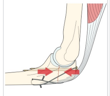
When tension band wiring is performed for general olecranon fractures, insertion of Kirschner allows favorable compression force application.