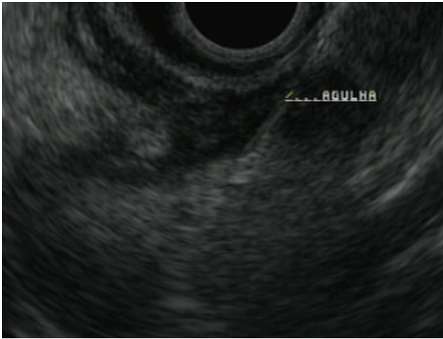
Figure 2 Fine needle aspiration guided by endoscopic ultrasound of the lesion.