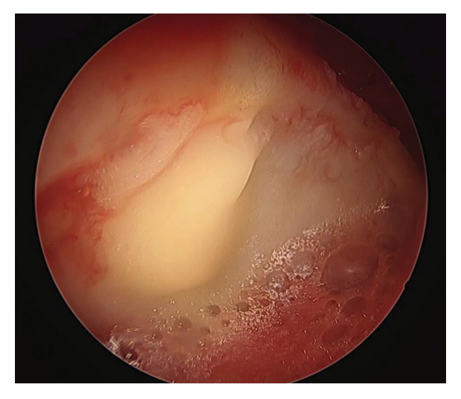
Figure 3. Intra-operative image of MATT. Lipogems<sup>®</sup> injected directly in the delaminated area by a needle after water suction