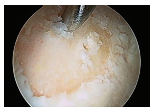
Figure 2. Intra-operative image of MFx. Subchondral bone was perforated by hammering the awl to allow bleeding

ing a completely closed system (Lipogems®), avoiding enzymes, additives, and other manipulations. The harvested tissue was therefore manually microfragmented in order to remove blood and oil residuals and washed with saline solution. The product obtained (the transplant), of about 7 ml, incorporates MSC into bioactive units (23). One needle was inserted in between the subchondral bone and the fibrous chondral layer and the transplant injected directly in the delaminated area, after removing the arthroscopic fluids from the joint (Fig. 3).