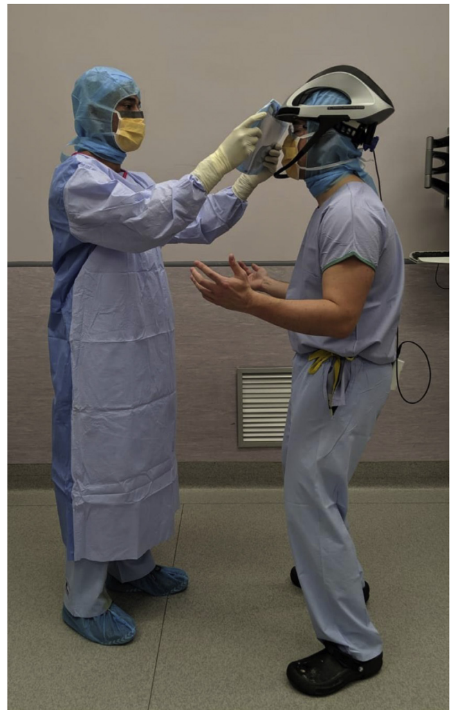
Figure 1. Application of the surgical hood by a scrub nurse.

Early activation of surgical helmet resulted in significant contamination across majority of body regions (Fig. 3). Of the 3 trials, major level of contaminations was noted in all 7 body regions