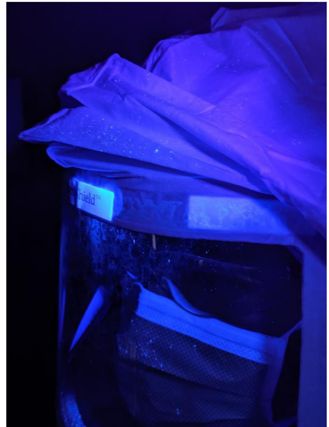
Figure 3. An example of major contamination on a surgical hood.

This method incorporating extended time before measurement demonstrated increased level of contamination in comparison to method 2. There is contamination to head region in 2 of the 3 trial runs. All levels of contamination are noted to be minor.