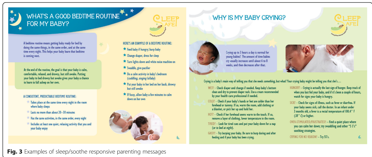
Fig. 3 Examples of sleep/soothe responsive parenting messages

Swinging, Side/Stomach Position, Sucking, and Swaddling [43]. They also received swaddle blankets and instruction and practiced swaddling their baby. We also highlighted strategies for dealing with night waking to promote self-soothing, including allowing the infant a brief time to self-soothe before intervening to soothe the infant.