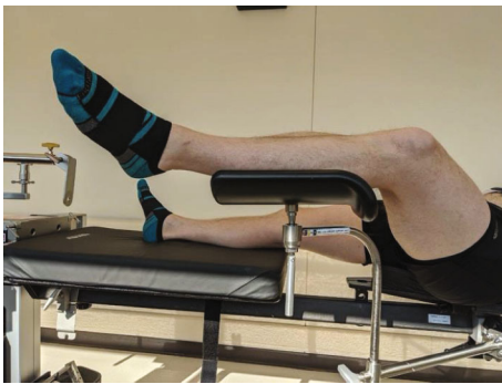
FIGURE 3: Demonstration of a Gopel style well leg holder on a patient in the supine position.

clinical, with the most salient feature being worsening leg pain despite appropriate leg elevation and analgesic medication. Other clinical features such as paresthesias, pulseless extremity, and pallor may also be suggestive of compartment syndrome but are not required for the diagnosis. When the diagnosis of WLCS is unclear, intracompartmental pressures may be measured but should be utilized with caution. In a prospective review of 48 patients with surgically treated tibial shaft fractures without clinical signs of CS, intraoperative compartmental pressure measurements revealed a 35% false-positive rate [10]. Other authors express similar concern in the specificity of one-time intracompartmental pressure monitoring for detecting acute compartment syndrome and the possibility of unnecessary fasciotomies [11]. Continuous compartment monitoring may be more useful in confirming the diagnosis. With this method, McQueen et al. analyzed 850 patients with diaphyseal tibia shaft fractures and reported a specificity of 98% and a sensitivity of 94% for detecting acute compartment syndrome [8]. For the authors, experienced intracompartmental pressure measurement should be limited to patients in which a physical