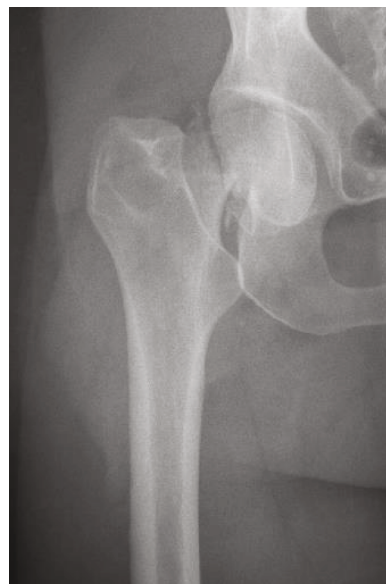
FIGURE 1: AP radiograph of the right hip demonstrating a subcapital femoral neck fracture.

Well leg compartment syndrome is uncommon, despite the frequency of lower extremity and pelvic surgical procedures performed annually [3]. The low incidence of WLCS makes identification and prevention challenging. The distinguishing factor of WLCS is the seemingly innocuous exposure in a well leg holder, such as the Gopel support (Figure 3), which should be avoided if possible. The utilization of a well leg holder allows for improved fluoroscopic imaging during surgery. However, other strategies can be utilized to facilitate intraoperative imaging. Brouze et al. described securing the nonoperative leg to the traction bar of a fracture table with