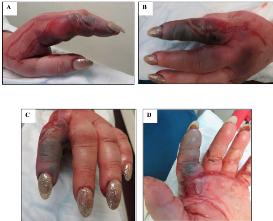
Figure 1: Images showing 65-year-old woman with initial features of NF to left hand; (A) radial view, (B and C) dorsal view, (D) volar view.

due to multiple meningiomas for which she was maintained on dexamethasone treatment (4 mg/day) for 6 months.