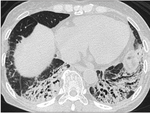
Figure 3: Follow-up high-resolution computed tomography image from basal region demonstrates improvement in consolidations and aeration but persistence of traction bronchiectasis

arthralgias, Raynaud's phenomenon, and exanthema on the hands (mechanic's hands). [1] Anti-ARS antibodies are directed against a family of cytoplasmic enzymes (anti-ARS) that catalyze the formation of the aminoacyl-tRNA complex from an amino acid and its cognate tRNA and play a vital role in protein synthesis. Antisynthetase antibodies so far described include anti-Jo-1 (anti-histidyl), anti-PL-7 (anti-threonyl), anti-PL-12 (anti-alanyl), anti-OJ (anti-isoleucyl), anti-EJ (anti-glycyl), anti-KS (anti-asparaginy), anti-KS (anti-asparaginy), anti-ZO (anti-phenylalanyl) snit-YRS (anti-tyrosyl). [1,2] The most commonly detected anti-ARS antibody is anti-Jo-1.