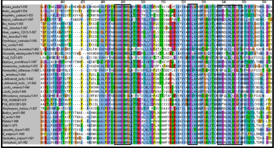
Figure 3: Multiple sequence alignment of different APN protein sequences showing three highly conserved regions (highlighted in boxes).

The OS-3 is docked on to 623NRT625 motif of APN. The oxygen atom in OS-3 formed three hydrogen bonds with different residues (Ser621, Arg624 and Thr625) of APN like with bond lengths of 17.9, 17.7 and 16.1 respectively. The final docked complex of APN-OS-3 has a binding energy of 24026.9 Kcal/J. OS-4 was docked to 751NGS753 motif of APN and the oxygen atom formed two hydrogen bonds with different residues of APN Ser754 and 752Asp 752 with bond lengths of 4.54 and 8.46,