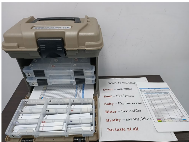
FIGURE 2 Waterless Empirical Taste Test

a proprietary binder and positioned on brown strips at the bottom of the pages of each test booklet. 8 At the beginning of the UPSIT-TC, all subjects release each of the 40 odorants by scratching the brown strip with a pencil tip. They are then asked to choose a name from a set of four odor descriptors to identify the released odorant. The test is scored by the number of odors identified correctly to generate a maximum score of 40. An olfactory diagnosis of UPSIT-TC has been established in relation to gender and age. 9 For example, the cutoff scores are set at 29.5 between normosmia and mild hyposmia for male adults whose ages range between 20 and 59 years, and are set at 30.5 between normosmia and mild hyposmia for female adults whose ages range between 20 and 59 years.