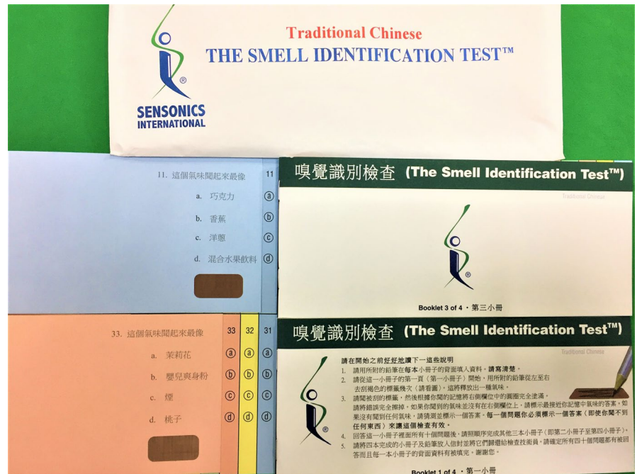
FIGURE 1 Traditional Chinese version of University of Pennsylvania Smell Identification Test