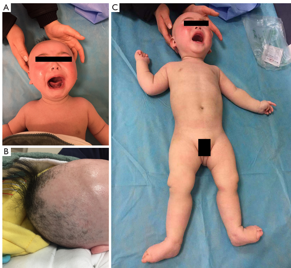
Figure 1 Photographs of the patient. (A) Facial appearance and alopecia. (B) Kinky and fragile hair. (C) Hypopigmented skin, joint laxity, and hypotonia.

the CARE reporting checklist (available at https://dx.doi.org/10.21037/tp-21-275 ).