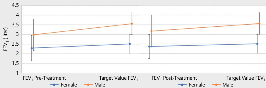
► Fig. 3 Comparison of actual pre-/post-treatment FEV 1 values and reference FEV 1 values for female and male patients. Legend: FEV 1 (liter) = forced expiratory volume in the first second; pre-treatment: measurement before start of rehabilitation and post-treatment: measurement at the end of rehabilitation; target values: calculated from body-plethysmography

values for healthy people [25] at rehabilitation discharge, there was a discrepancy between male and female patients, with significantly poorer walking endurance in males. From this could be derived that it is women rather than men who may be closer to a healthy status of functional exercise capacity after a three-week pulmonary rehabilitation program.