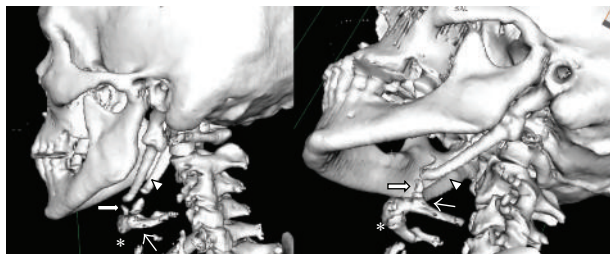
FIGURE 2: 3D reconstruction of hyoid bone-styloid process extension. 3D reconstruction of hyoid bone and styloid process. Thick arrow points to area of extension between hyoid bone and styloid process. Asterisk marks hyoid bone body. Thin arrow points to lesser horn of hyoid bone. Arrowhead marks styloid process.

has recently been hypothesized to develop from a midline condensation of mesenchymal cells that is disparate from the second or third pharyngeal arches [3].