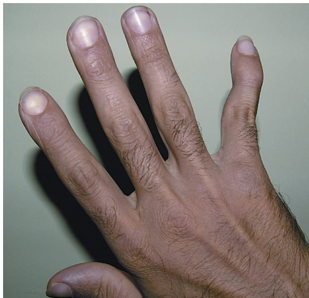
Figure 1. Swan-neck deformity in the fifth finger due to previous attacks of rheumatoid arthritis.

complaining of bilateral ocular irritation and progressive visual deterioration over the past 4 years. Past ocular history was negative for wearing contact lenses or previous ocular infections and there was no family history of ocular disorders. Previous records revealed no gross ocular abnormalities until 4 years ago. The patient reported pain, redness and swelling in the distal joints of his hands, and had been diagnosed with seropositive rheumatoid arthritis since the age of sixteen. The proximal interphalangeal (PIP) and metacarpophalangeal (MCP) joints in both hands were principally involved resulting in significant deformity in the fifth fingers (Fig.1). At presentation, rheumatoid arthritis was well controlled with