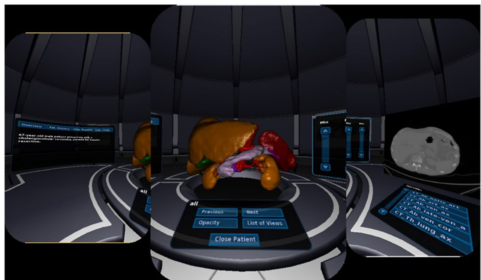
Fig. 1 Virtual Reality environment from inside the Oculus Rift®. Patient information (left), 3D-model (middle), and original sectional imaging (right)