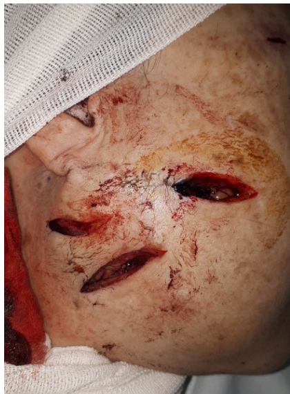
Fig. 1. A 79-year-old woman with three stab wounds on the right cheek.