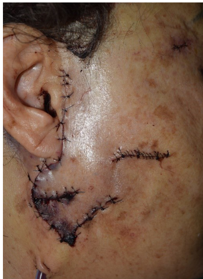
Fig. 3. Postoperative photograph 1 day after surgery.