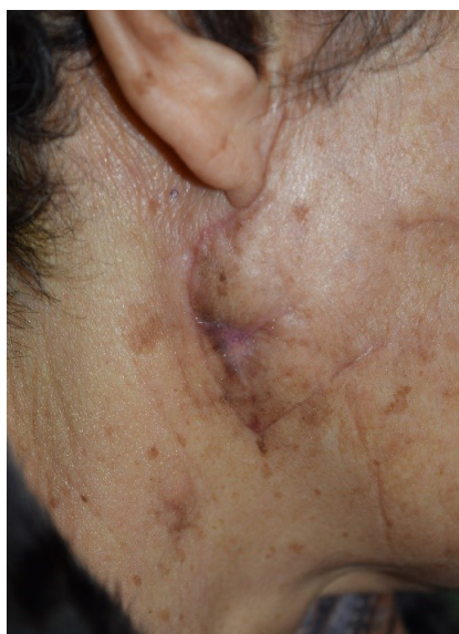
Fig. 4. Postoperative photograph 7 weeks after surgery.

the parotid glands and an injury at a marginal mandible branch of the facial nerve (Fig. 2). After neurorrhaphy for the facial nerve injury, the wound was sutured, and a closed 100-mL Jackson-Pratt drainage tube was inserted (Fig. 3). The injured parotid gland area was not wide in size and the tissue was soft, so it was not repaired.