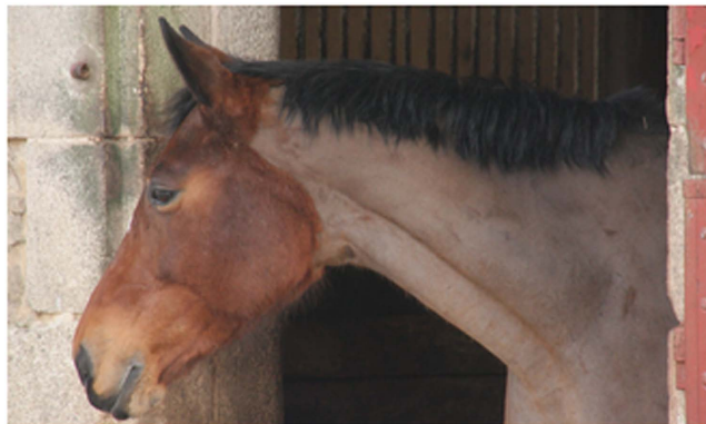
Figure 1. Attention or monitoring behaviour in horses is characterized by standing motionless at the stall door, with their neck horizontal or slightly elevated, ears and neck mobile, and slowly scanning their environment by moving their head laterally or occasionally gazing for a short moment at environmental stimuli.