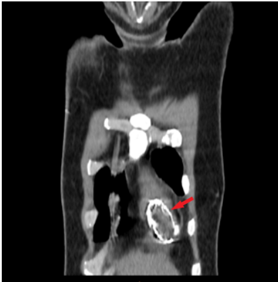
FIGURE 3: Thoracic tomography showing the intracardiac hydatid cyst.