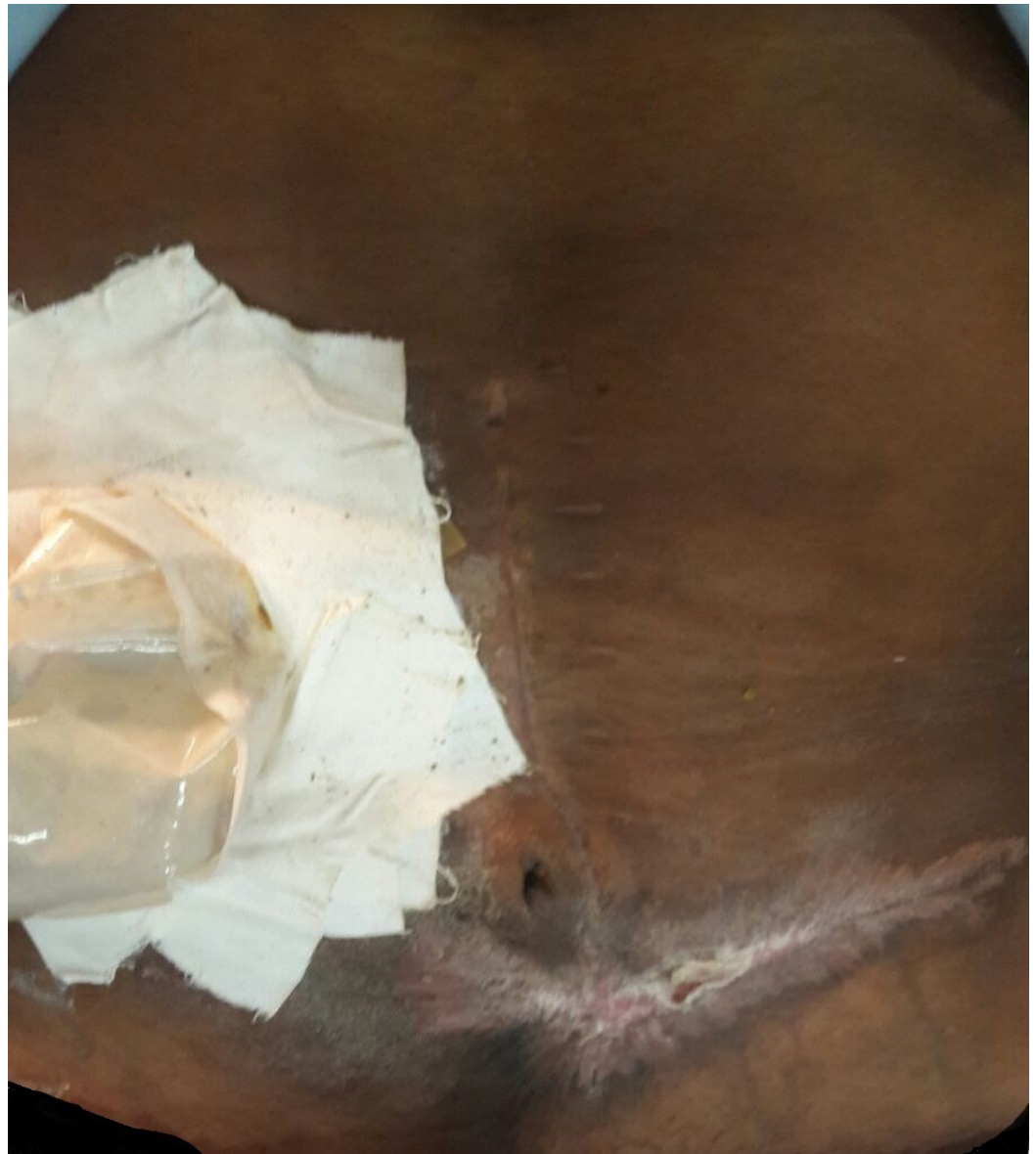
FIGURE 3: Four months after initial debridement

The outcome four months after the initial debridement. There is a healed scar at the debridement site in the left-lower quadrant of the abdomen.