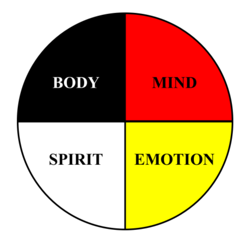
Figure 2. Medicine Wheel.

symbol, its meanings, and applications. For the purposes of this program, this symbol is a nonlinear model of human development emphasizing balance while developing equally the physical, mental, emotional, and spiritual aspects of knowing and being. In other words, it is a holistic way of living a healthy life by nurturing and keeping all of the aspects of self in balance.