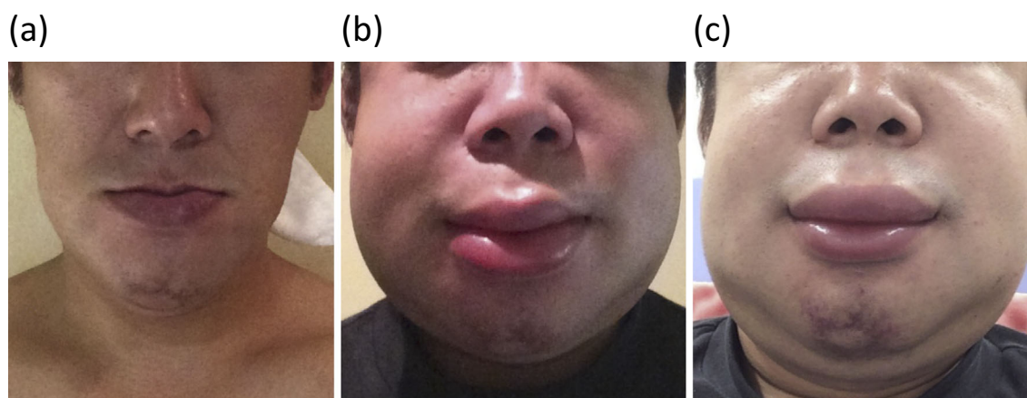
Figure 1. Progression of edema in the patient's face. a) Shortly following injury. b) Fourteen hours after the injury. c) Seventeen hours after the injury.