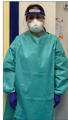
Figure 3 Personal protective equipment used in the endoscopy unit during the COVID-19 pandemic