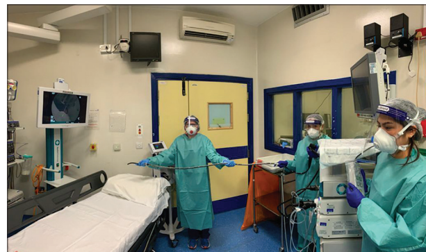
Figure 4 Setup of the endoscopy room during an anterograde double-balloon enteroscopy at the Royal Free Hospital in London

recuperate the endoscopic activity canceled during the delay and the lockdown phases ranges from 103-155, depending on the PPE policy/perceived COVID-19 transmission risk, as described by Gupta et al [24]. We are also very likely to see a “domino