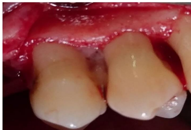
Figure 2. Defect zone containing PRGF.

prescription (amoxicillin, 500 mg, TID), the directions for oral hygiene (0.12% chlorhexidine, 5 mL, BID) and with the recalls schedule.