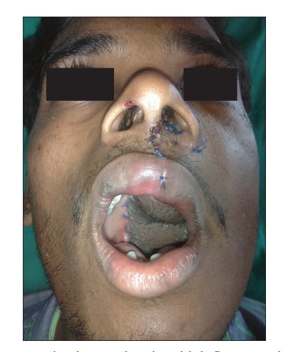
Figure 3: Postoperative image showing thigh flap at excised site in the oral cavity