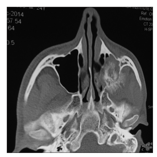
Figure 2: Computed tomography scan image of the maxilla shows maxillary sinus with surrounding soft tissue mass and sunray type of ossification