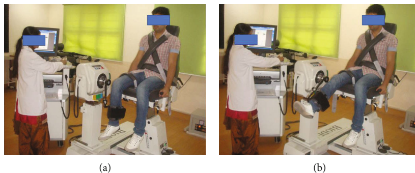
FIGURE 2: Measurement of quadriceps peak torque using Biodex isokinetic dynamometer System 4: (a) starting and (b) end positions.

their elastic resistance. For instance, a 1-meter length of yellow band or tube stretched to 100% (i.e., double the resting length) would produce about 1.36 kg of elastic resistance (Table 1) [28]. Each progressive band or tube produces 25% and 40% higher pull force in the clinical range (Figure 3) (tan through black) and the advanced range (silver through gold), respectively [28].