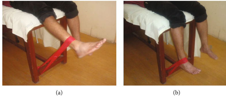
FIGURE 4: Eccentric knee extensor exercise with TheraBand or theratube: (a) starting and (b) end positions.

(14.52) kg, respectively. Table 2 gives details of the descriptive statistics of the demographic data. These variables had insignificant differences between the two groups.