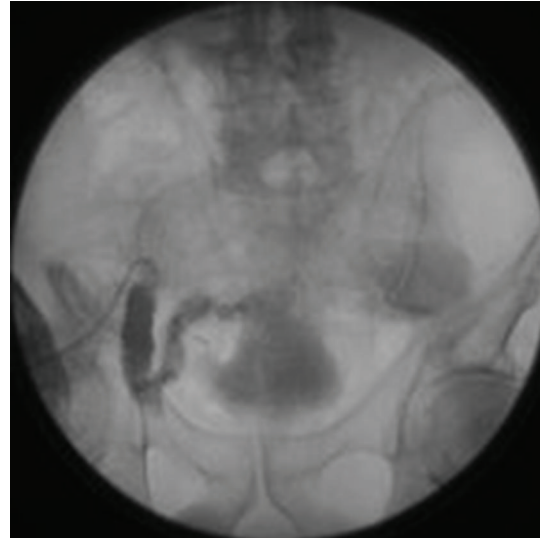
FIGURE 2: Loopogram demonstrating proximal contrast leakage from the conduit without visualization of either ureter.

In the absence of hydronephrosis, nephrostomy insertion was deemed to be too technically difficult and would require multiple needle punctures of the kidneys while attempting to gain access to the collecting system. In addition, the collapsed collecting systems would present a very confined space in which to attempt to maneuver needles, guide wires, and catheters. Because of the probability of procedure technical