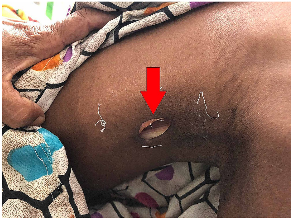
FIGURE 3: Ulcer on Inner Aspect of Knee

The biopsy report showed epidermal and dermal ulceration with necrosis, vascular proliferation, granular tissue formation with polymorphs, lymphocytes, plasma cells, and macrophages. The adjacent epidermis showed spongiosis, while there was mild hyperplasia and peri adnexal mixed inflammatory infiltration in the dermis. These histological features were consistent with the clinical diagnosis of pyoderma gangrenosum. Antinuclear antibody (ANA) profile and rheumatoid factor (RF) were done to trace an autoimmune origin as she had complaints of polyarthralgia which turned out negative. So we diagnosed her as a case of seronegative arthritis on the basis of her symptoms. Based on the clinical progression of the lesions, their pathergic response, resistance to antimicrobial therapy, negative acid-fast bacteria (AFB) staining, and skin biopsy findings along with the pre-existing seronegative arthritis we diagnosed her as a case of pyoderma gangrenosum. The culture sensitivity report of the pus suggested pseudomonas which was sensitive to piperacillin and tazobactam. The patient was started on oral prednisolone 40 mg (OD), injectable clindamycin (TDS), and piperacillin-tazobactam (TDS). The patient was under observation for five days and seemed to respond well to the therapy. She was discharged after one week with the guidance of home care and follow-up advice.