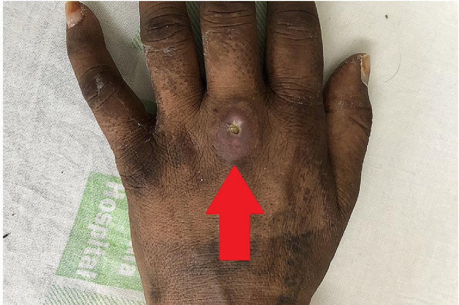
FIGURE 1: Ulcer on the Dorsal Aspect of Hand