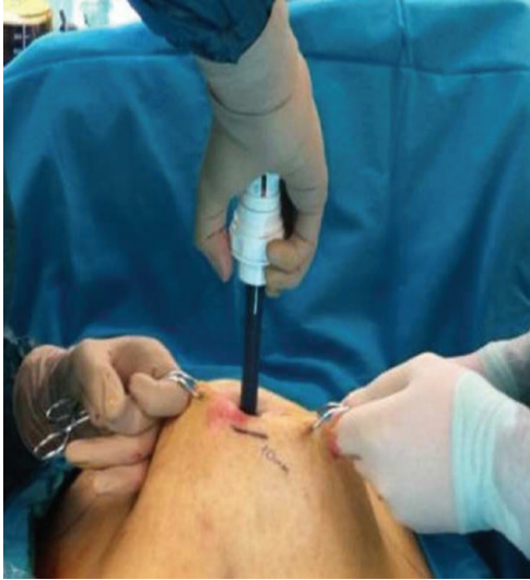
FIGURE 1: Counter traction of the skin edges during trocar insertion.

perforate the fibrosis. The fibrotic tissue was then perforated by a number 11 scalpel and this gate was enlarged by scissors to create a 1 cm free space. Then an 11 mm trocar could be placed with the method as described earlier. Abdominal wall compliance was very low, and pneumoperitoneum could be established with 1.8 liters of carbon dioxide. Additional robotic trocars could be placed in the left subcostal area again by hanging the trocar sites with towel clamps to avoid possible intestinal injury. It was difficult but possible to reach the ligament of Treitz and then to divide the great omentum. A standard gastric bypass was performed successfully. Her postoperative course was uneventful and she was discharged 4 days after surgery.