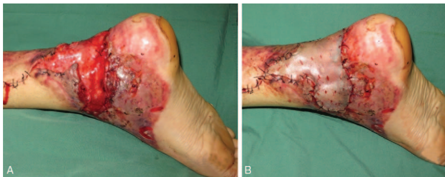
Figure 3. Superficial temporal fascia flap transplantation and skin grafting. (A) After transferring and fixing the fascia flap to the recipient site, we performed the end-to-end anastomosis of the superficial temporal vein and posterior tibial vein, as well as the end-to-side anastomosis of the superficial temporal artery and posterior tibial artery. (B) Grafting of thin split-skin.