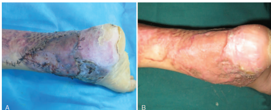
Figure 4. Treatment outcome and follow-up. (A) The fascia flap and grafted skin survived well at 1 week after operation. (B) At the 6-month follow-up, the grafted skin at the recipient site was even and without dysfunction. (C and D) Images taken at the 12-month postoperative follow-up.