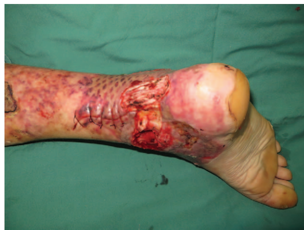
Figure 1. Characteristics of wounds of the posterior talocrural region. After surgical debridement, partial Achilles tendon exposure and malleolus bone exposure accompanied by osteomyelitis were observed. The total wound size was approximately 3.4 × 7.8 cm.

For extensively burned patients with deep damage in the posterior talocrural region, quick and high-quality repair of defects is difficult but necessary to maximize the functional