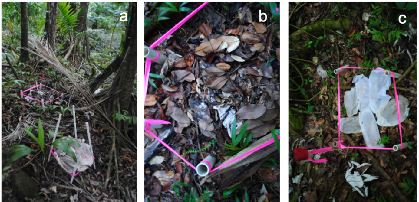
Figure 1. (a) Preconditioning of M. bidentata leaves suspended in baskets 10 cm above the forest floor. (b) Litter mat formed by basidiomycete mycelium, Gymnopus johnstonii . (c) Leaves in mesh bags placed on G. johnstonii litter mat.