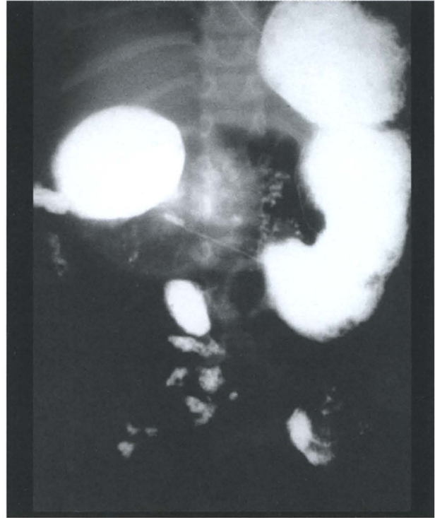
Figure 3. Upper gastrointestinal study showing a dilated duodenum that is incompletely obstructed, with contrast material passing distally through a central hole in a duodenal diaphragm.

Early diagnosis of CDO based on prompt recognition of symptoms and accurate interpretation of radiological investigations is important, as delayed diagnosis is known to be associated with increased morbidity and a prolonged hospital stay. 1 The diagnosis of complete CDO is usually easy, and in the majority of cases this can be established with plain film radiographs and upper gastrointestinal barium studies. 6 Although the classic double-bubble appearance with absent air distally on plain abdominal radiographs is pathognomonic of CDO, it is not specific, and is also seen in patients with small bowel volvulus, and sometimes in patients with tight duodenal stenosis. 6 The importance of differentiating CDO from malrotation, with its risk of midgut volvulus and gangrene, needs to be emphasized. A barium meal is helpful in this regard if it shows the typical coil spring appearance of small bowel volvulus, or if the duodenojejunal junction is noted as low and to the right of midline, suggesting malrotation, which can be confirmed by barium enema. 6,8,9 The presence of CDO with a doublebubble appearance and distal gastrointestinal air is one of the contributing factors for delayed diagnosis