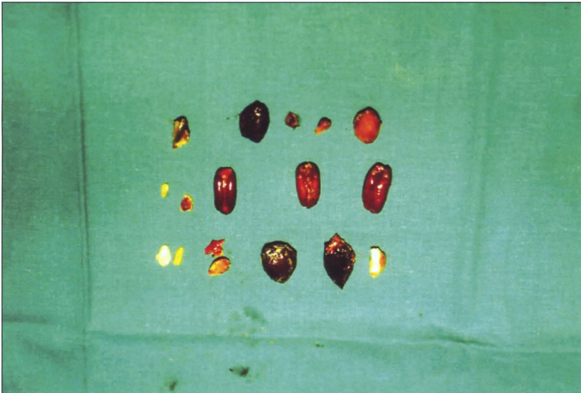
Figure 4. Operative photograph of the date seeds that caused obstruction of an aperture in a duodenal diaphragm in a 3-1/2-year-old girl with Down's syndrome.