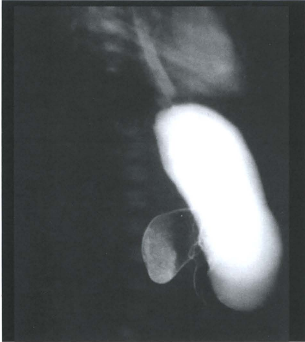
Figure 1. Upper gastrointestinal study showing duodenal obstruction secondary to a complete duodenal diaphragm.