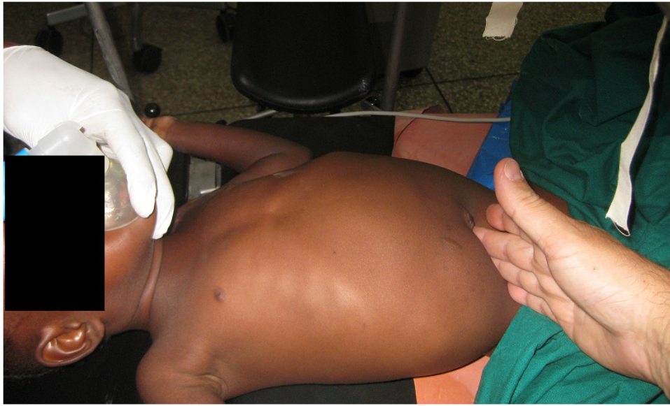
Figure 1 Clinician's hand indicating the inferior tip of the abdominal mass in a child with mesenteric dermoid cyst