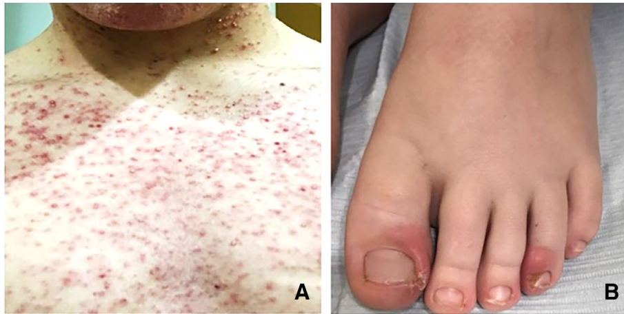
Figure 1. Skin toxicity associated with MEK inhibitors. (A): Acneiform rash in a postpubertal adolescent. (B): Paronychia in a child.