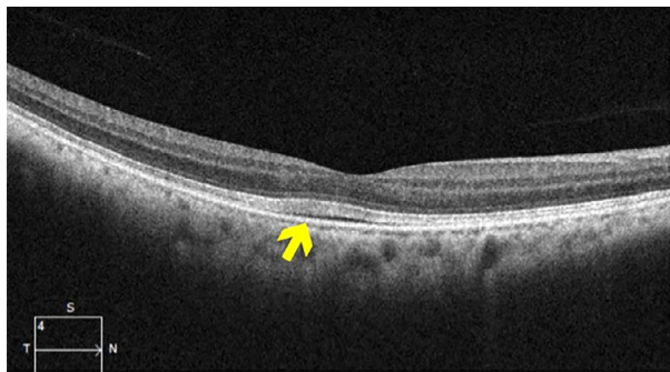
Figure 3. Ocular coherence tomography demonstrating a small retinal detachment and underlying fluid (arrow).

inhibitor use and may lead to permanent blindness. Fortunately, in adult MEK inhibitor trials, these serious retinal toxicities are reported in fewer than 1% of patients [46, 47].