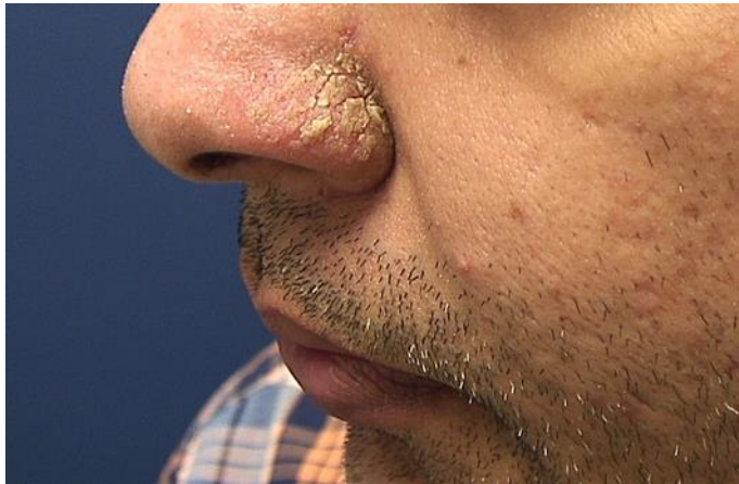
Fig. 1. 1.0 × 1.5-cm verrucous-like encrusted plaque and underlying erythema on the left ala.