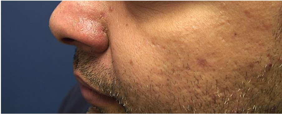
Fig. 3. The lesion after treatment with onetime intralesional injection of 2.5 mg/mL of triamcinolone and 3-week topical application of triamcinolone ointment.