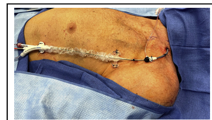
Percutaneous supraclavicular subclavian intra-aortic balloon pump.

Currently published techniques (surgical and percutaneous) have described intra-aortic balloon pump (IABP) placement in the axillary artery. 1-3 The incidence of migration, driveline kinking, and IABP malfunction has been reported as a common problem (more than 40% in some series). 2 Here we describe our preferred IABP placement technique, via the left supraclavicular subclavian artery, using a long wire-reinforced introducer. The straighter course