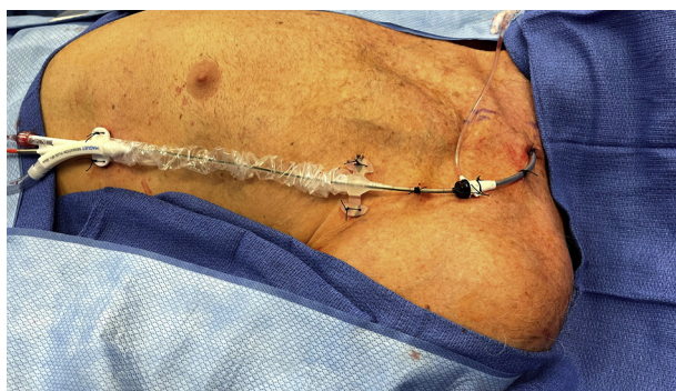
FIGURE 3. Securing the subclavian intra-aortic balloon pump.

It is important to adequately secure the subclavian IABP because the primary goal of this IABP placement technique is to allow ambulation and rehabilitation. Finally, 0-silk sutures are used to secure the sheath and the IABP tabs, but the IABP driveline itself is also secured to the skin as well as the sheath (Figure 3). Adhesive film such as Ioban (3M, Saint Paul, Minn) can be used to secure the IABP and sheath further.