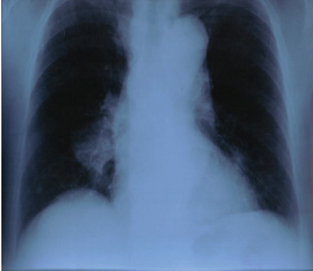
FIGURE 1: X-ray of the chest.