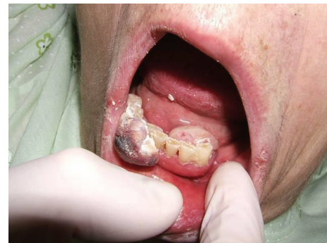
FIGURE 4: Metastasis in the oral cavity.