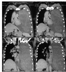
Figure 2: Contrast enhanced computed tomography thorax: Large lobulated mass in left hemithorax with pleural effusion and mediastinal shift to right