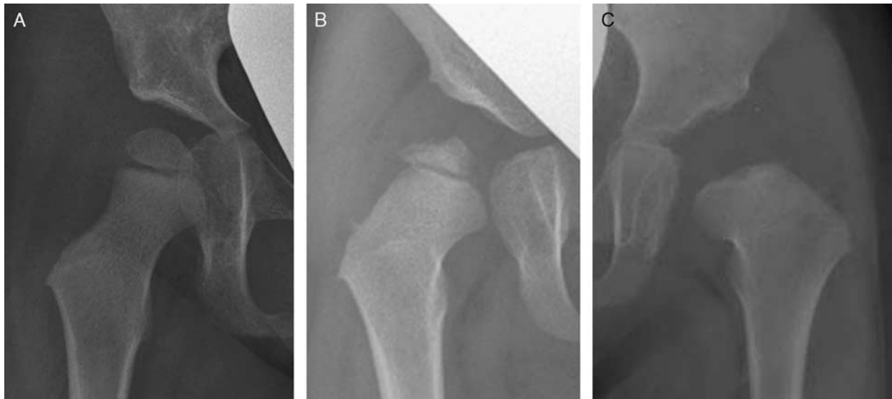
FIGURE 2. A, AP view of the right hip demonstrating a normal-appearing hip 36 months following closed reduction. B, AP view of the right hip demonstrating epiphyseal fragmentation 23 months following closed reduction, which was classified as AVN. C, AP view of the left hip 18 months following closed reduction demonstrating absence of the ossific nucleus and broadening of the femoral neck, which was also classified as AVN. AP indicates anteroposterior; AVN, avascular necrosis.