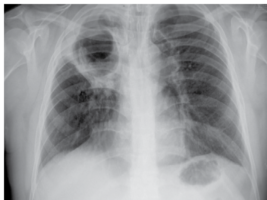
Figure 1. Chest X-ray of a 39-year-old male patient with a history of pan-susceptible tuberculosis treated for six months in 2007. The patient was considered cured. Later in time, he reported a six-month history of cough, mild dyspnea, but no fever. Tuberculosis relapse was ruled out; sputum smear microscopy and culture were negative. The image shows a giant cavity in the right upper lobe and some fibrotic changes.

Lee et al. (22) investigated lung function and post-bronchodilator response in 21 patients with