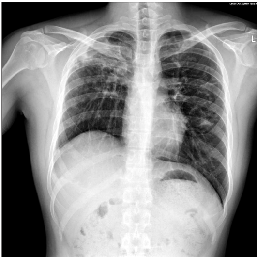
Fig. 1. Preoperative Chest PA showed sequelae of tuberculosis in both lung fields.