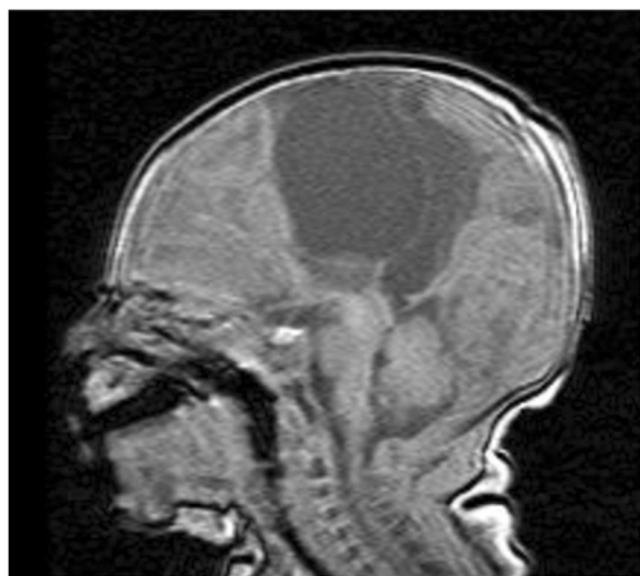
Figure 1 Sagittal T1 image at 5 days old demonstrating interhemispheric cysts and agenesis of corpus callosum.

A brain MRI at 5 days old confirmed agenesis of the corpus callosum, two expanding interhemispheric cysts, and left focal cortical dysplasia (Figure 1). At 1 month of age, the patient underwent a left parietal craniotomy and fenestration of the interhemispheric cysts. Post-surgery, a pediatric head ultrasound revealed possible postoperative hematoma. At 2 months of age, a head ultrasound revealed a slight decrease in size of the multiloculated midline cysts and a cystic change within the parasagittal