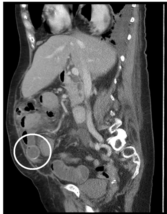
Figure 2 Sagittal computed tomography image shows a calculus in the distal small bowel with proximal dilatation.

Twelve months later, she presented with a further episode of central abdominal pain associated with vomiting and distension. An ultrasound scan revealed a contracted gallbladder with a 10mm common bile duct, and intravenous antibiotics were commenced for a presumed cholecystitis. She failed to settle, and a CT scan revealed free intraperitoneal gas and fluid, a persistent cholecysto-duodenal fistula, and a further gallstone obstructing the small bowel. This gallstone corresponded in size and shape to that seen in the gallbladder 12 months earlier (Figure 2). At laparotomy, a limited small bowel resection was performed for perforation proximal to a gallstone obstruction. The stone was removed, and a hand-sewn anastomosis was performed. Her post-operative recovery was again complicated by a C. difficile infection in addition to a prolonged period of respiratory failure managed with a tracheostomy in critical care. She was discharged to her own home six weeks after surgery and made a good recovery. Two months after discharge, magnetic resonance cholangiopancreatography did not visualize any residual gallbladder stones.