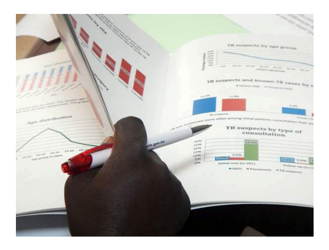
Fig. 1. Feedback report.

Based on the results of the first audit, performance feedback was developed for each of the healthcare providers. This included a feedback report where the results from the first audit were summarized in words, tables, and diagrams focusing on the healthcare providers' overall practice for suspecting tuberculosis and referral of tuberculosis suspects for further investigations (Fig. 1). Moreover, a personal feedback sheet was developed for each participant to enable the individual participant to compare their own results with those of their peers. The feedback report and personal feedback