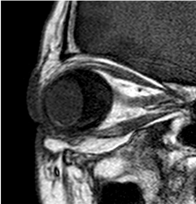
Fig. 2. Magnetic resonance imaging scan taken 6 months after reinjection of silicone oil. The T1-weighted image shows low signal intensity and the upper palpebral tissue has a moist appearance, suggesting edema or inflammation.