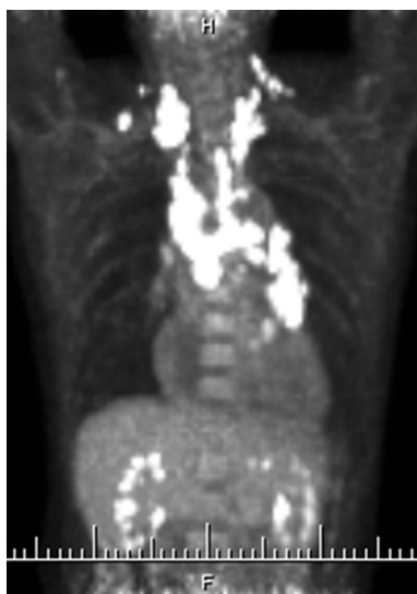
Figure 2. Positron emission tomography with 18-fluorodeoxyglucose (FDG-PET) revealed the uptake of FDG in the primary tumor and multiple lymph nodes, including cervical lymph nodes.

tumor size of other lesions was decreased (Fig. 1C, D). Emergency pericardial drainage was performed, and 1,660 mL of bloody pericardial fluid was extracted. Hypotension and tachycardia eventually improved. A cytological examination of the pericardial fluid confirmed the presence of adenocarcinoma. An analysis of the pericardial fluid revealed the following: pH 7.2, total cell count 3,153/ \mu L (lymphocytes 36%, neutrophils 22%, histiocytes 10%, others 32%), protein 7.4 g/dL, glucose 13 mg/dL, and lactate dehydrogenase 11,401 IU/L. After removing the drainage tube, the second course of chemotherapy, carboplatin and nab-PTX without atezolizumab, was initiated. During the second course of treatment, the amount of pericardial effusion did not increase and the tumor size of other lesions decreased further (Fig. 1E, F). Hence, atezolizumab combined with carboplatin and nab-PTX was re-administered as the third course of treatment. Seven months have passed since the cardiac tamponade developed, and the patient is continuously receiving maintenance therapy with atezolizumab with no signs of disease progression, including pericardial effusion.