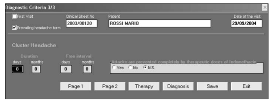
Fig. 3 Third sheet of the computerised record in the latest version. This third screen allows the user to return to screens 1 and 2, to access the output diagnosis, and also to save the data. There is also a button for access to an additional sheet dedicated to symptomatic and prophylactic treatment and for additional annotations

The module is now in beta 1 testing for the diagnostic category, 1.3 Childhood periodic syndromes , which are common precursors of migraine, and in time the software will also include this important migraine subtype, for which an additional screen will be dedicated.