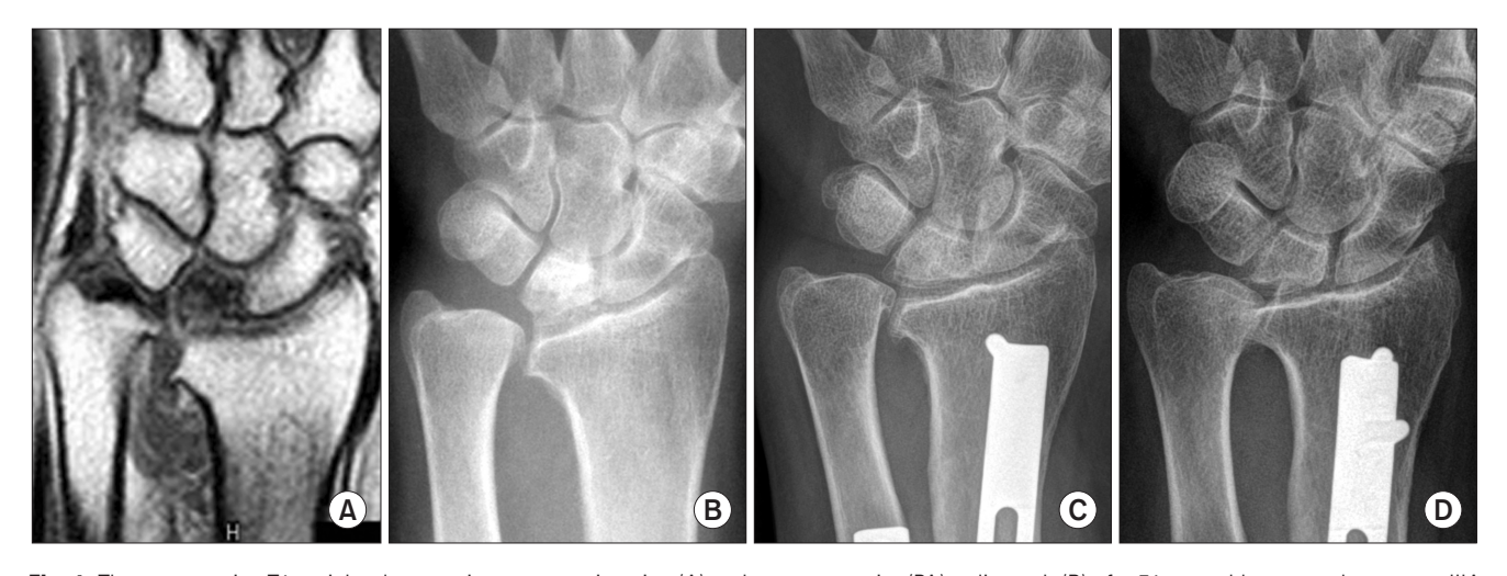
Fig. 1. The preoperative T1-weighted magnetic resonance imaging (A) and posteroanterior (PA) radiograph (B) of a 51-year-old woman show stage IIIA Kienböck's disease in the left wrist. (C) The 5-year postoperative PA radiograph shows a decreased sclerotic lesion in the lunate. (D) The PA radiograph taken at the last visit at postoperative 11 years shows that the morphology of the lunate became nearly normalized. The bony trabecular pattern inside the lunate was similar to surrounding carpal bones. No progression of arthritic changes was visible in the radiocarpal and midcarpal joints.

Several studies have reported on the role of radial osteotomy in the treatment of advanced stage Kienböck's disease. Iwasaki et al.<sup>6)</sup> compared the results between radial shortening osteotomy and radial wedge osteotomy in Lichtman stage IIIB and IV Kienböck's disease patients. All patients showed good or excellent clinical results regardless of procedures and 25% of patients (5 of 20 patients) showed radiological improvement of the lunate. However, they evaluated patients with a modified form of NSSK